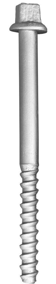
LX SCREW Part No. 57/48932 1" x 12"