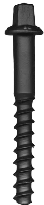
CONCRETE BEARER CHAIRSCREW Part No. 57/048037