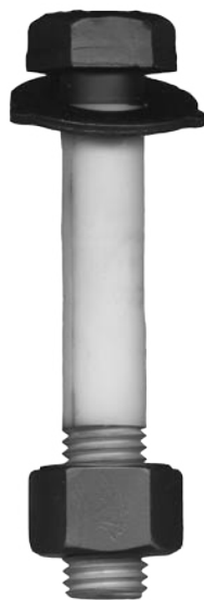
INSULATED SHANK FISH BOLT