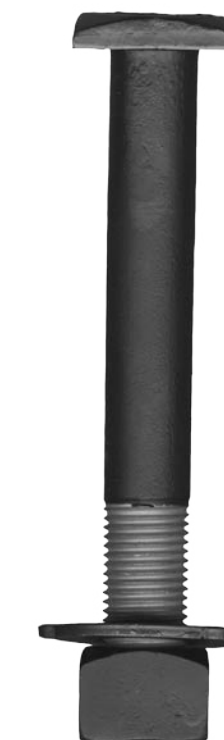
SWITCH & CROSSING 'V' GRADE BOLT (THIN HEAD) Complete with Renlok nut and through hardened washer Part No. 57/023499 1" x 7 3 / 4 " 57/023500 1" x 8"