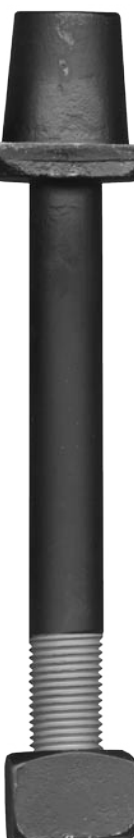
STUD BOLT (TOP HAT BOLT) Complete with Renlok nut Part No. 57/048417 1 1 / 8 " x 7 3 / 4 "