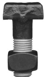
'T' HEAD CLIP BOLT Complete with nut Part No. 57/48116 7/8" x 3 1 / 2 " 57/48102 7/8" x 2 1 / 16 "