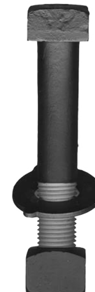
SQUARE ROUND SQUARE 'V' GRADE FISHBOLT Complete with Renlok nut and through hardened washer Part No. 57/52203 1 5 / 16 " x 6 1 / 4 " without washer 57/52202 1 1 / 8 " x 6 1 / 4 " 57/52230 1 1 / 8 " x 7" 2 washers