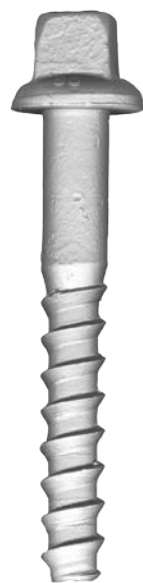
CHAIR SCREWS All 1" x 6 5 / 16 " Part No. 57/48191 - A.S. Screw 57/48193 - M. Screw 57/48195 - H.T. Screw (50 T.T.)