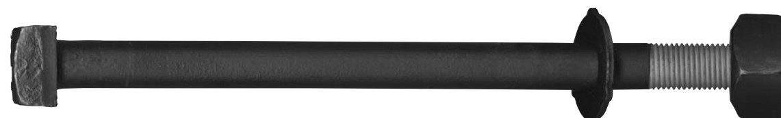
SQUARE ROUND SQUARE 'V' GRADE CROSSING BOLT Complete with Renlok nut and through hardened washer Part No. 57/150011 - 150077 1" up to 770mm