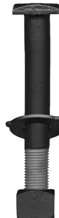
PAN PEAR SQUARE FISH BOLTS Complete with Renlok nut and hardened washer Part No. 57/52102 1" x 6" without washers 57/52100 1 5 / 16 " x 5"