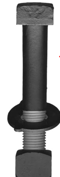
SQUARE ROUND SQUARE 'V' GRADE FISHBOLT Complete with Renlok nut and through hardened washer Part No. 57/52203 1 5 / 16 " x 6 1/4" without washer 57/52202 1 1/8" x 6 1/4" 57/52230 1 1/8" x 7" 2 washers