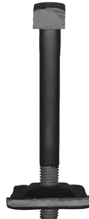
SQUARE ROUND BLACK FISHBOLT Complete with Renlok nut and through hardened washer Part No. 57/52104 1" x 6 1/4" 57/52110 1 5 / 16 " x 5 1/2"