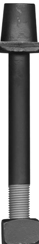
STUD BOLT (TOP HAT BOLT) Complete with Renlok nut Part No. 57/048417 1 1/8" x 7 3/4"