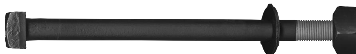
SQUARE ROUND SQUARE 'V' GRADE CROSSING BOLT Complete with Renlok nut and through hardened washer Part No. 57/150011 - 150077 1" up to 770mm